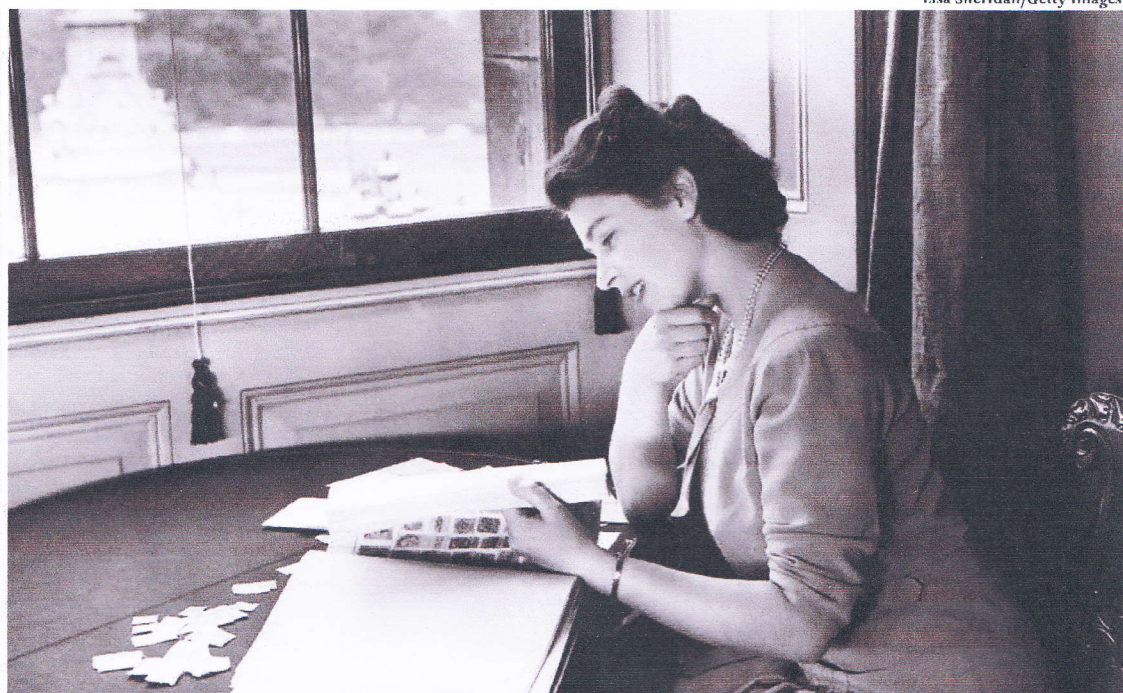
Stamp of authority: the Queen owns the largest and most valuable stamp collection in the world

“We’re seeing Middle Britain, Middle England... people who have worked hard for decades and want to see their savings secure